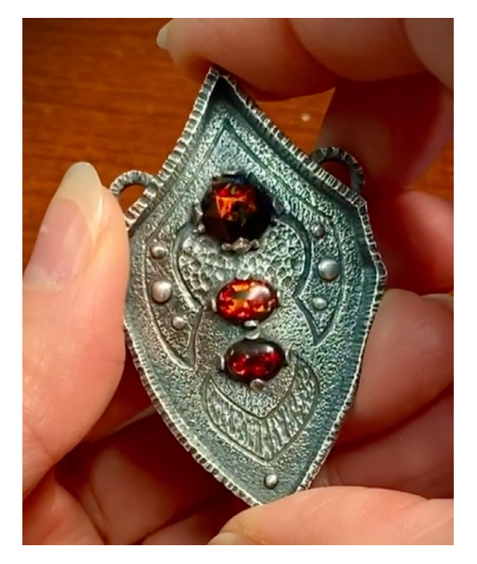
Fine Silver 960 Metal Clay and Pink Lady Cultured Opal Trillion by Holly Gage