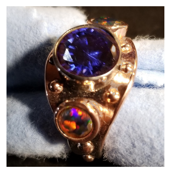
Copper Metal Clay and Black Fire in Place Culture Opals by Michael Galvin