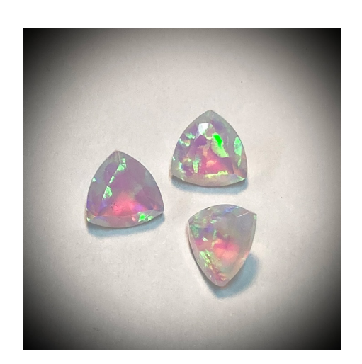
Pink Lady Fire in Place Cultured Opal 8mm Trillion