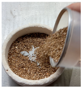
Deep Vermiculite Burial

This Cultured Opal can be fired directly in a Torch on a bed of vermiculite. Stone facing down, culet or pointed side facing up.